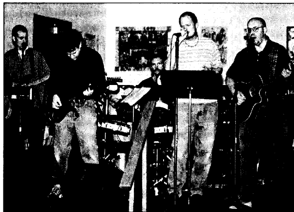
Members from the Las Vegas Mountain View church provide accompaniment for a half hour of praise songs prior to the devotional message.

It's early Sunday morning Nov. 7, and more than a dozen members of the Las Vegas Mountain View church are busy mixing pancake batter, setting out dishes and other tableware, preparing breakfast in a local public elementary school auditorium.